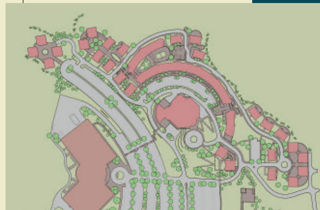
Master plan of Quinnipiac's proposed York Hill Campus, to be built using funds generated by the bond issue.

In September, the firm unveiled its Community Law Section, which is devoted to the needs of governmental and private community organizations. We work with state and municipal entities (including police departments and fire departments), as well as condominium associations, neighborhood groups and other collectives, on such issues as statutory compliance, revenue collection, brownfield redevelopment, document revision, and operating contracts and their legal powers.