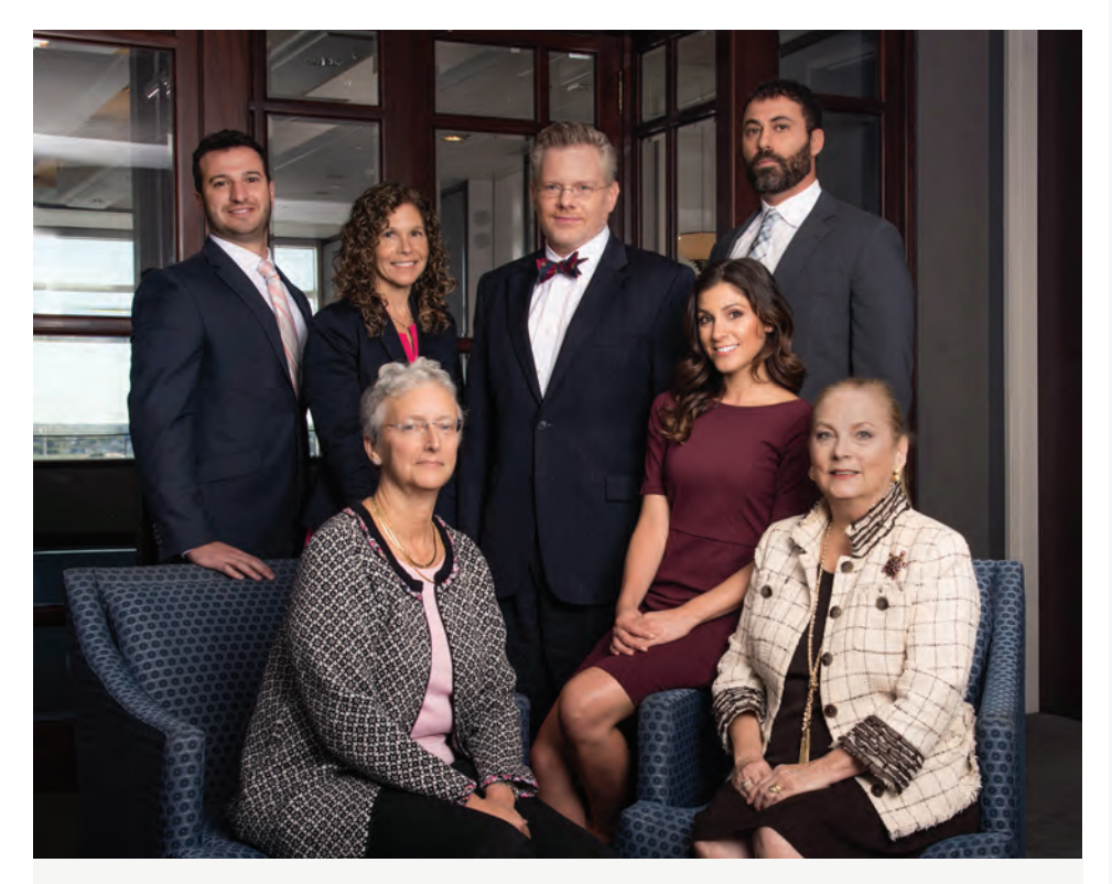
The firm's Family law attorneys were recognized by the Connecticut Law Tribune and named the 2017 "Family Law Department of the Year, Midsized Firm."

The firm's Family Law practice remains at the leading edge of Connecticut matrimonial law, regularly litigating, mediating, arbitrating, and defending and prosecuting